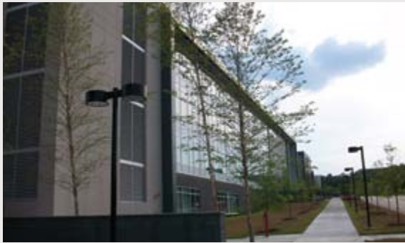
Wake Tech Building - Raleigh, NC