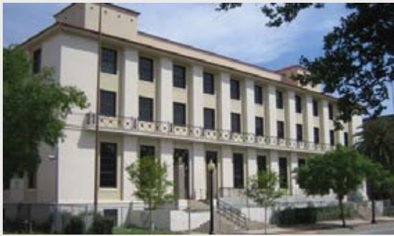
Winston Arnow Courthouse - Pensacola, FL