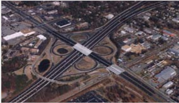
Military Highway/Interstate 264 Interchange - Norfolk, VA