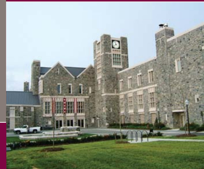
Virginia Tech - Alumni Center - Blacksburg, VA (right)