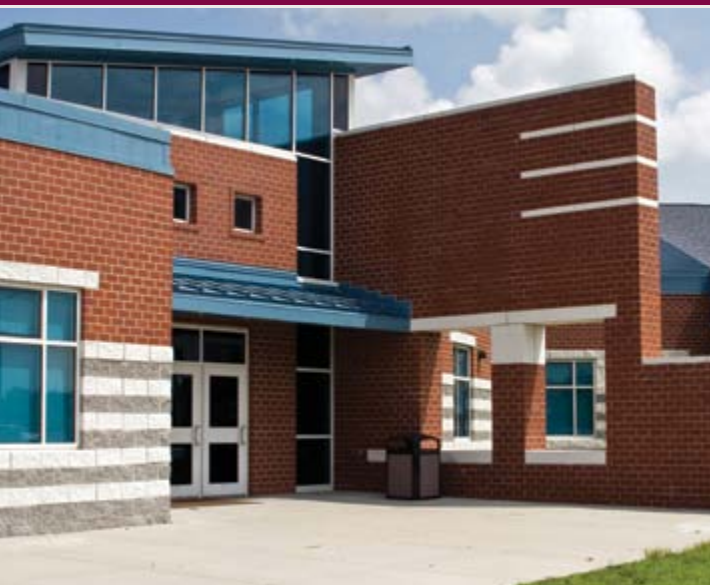
Creekside Elementary School - Suffolk, VA (left)

So whether the project is large or small, MBP delivers results!